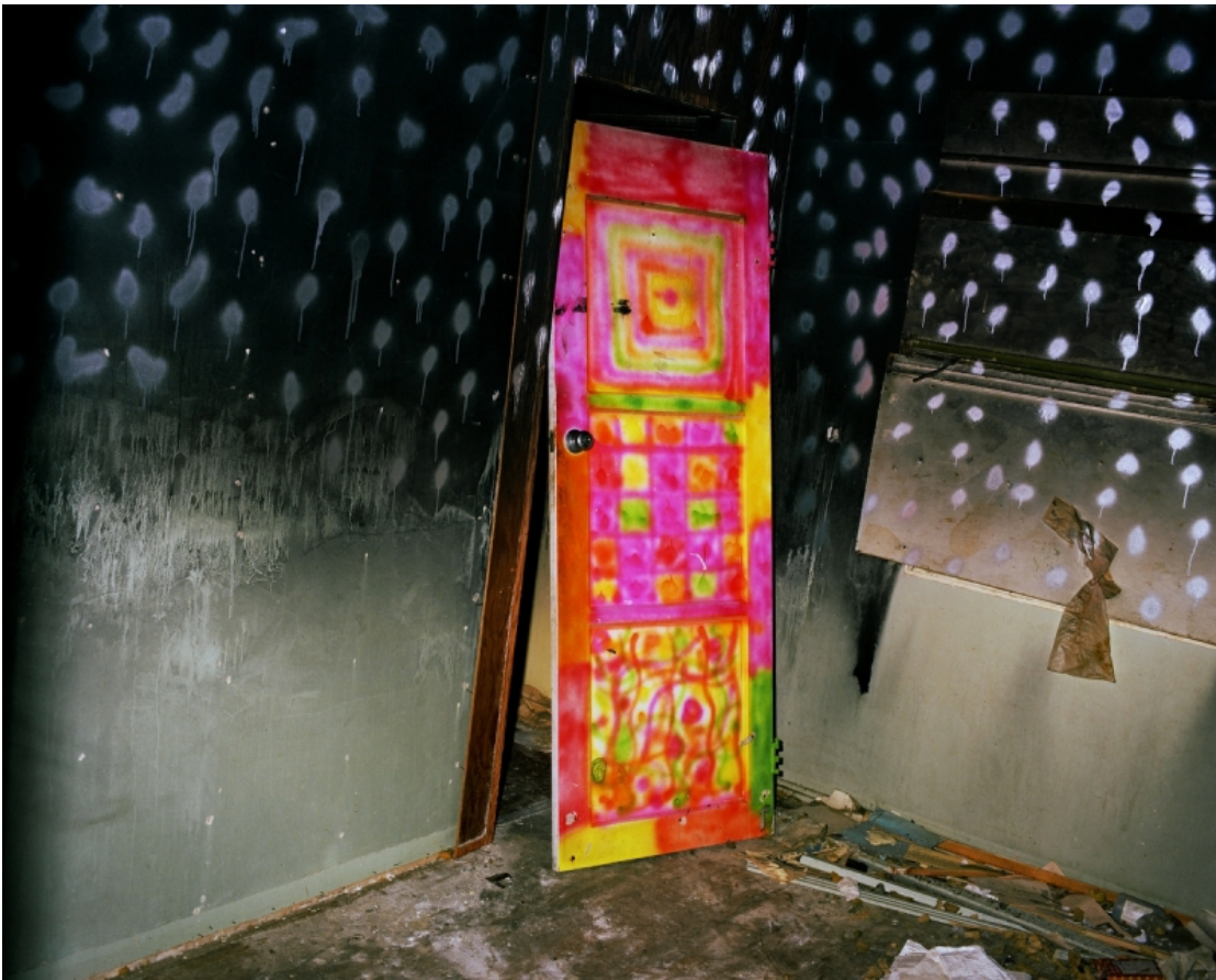
John Divola Zuma #69, 1977/2006 Archival Pigment on Rag Paper 61 × 76,2 cm (24 × 30 inches)

STAY UP TO DATE ON GALLERY EXHIBITIONS, NEWS, AND EVENTS