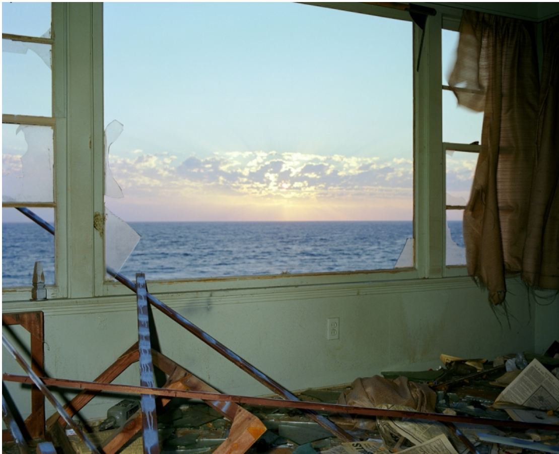
John Divola Zuma #48 , 1977/2006 Archival Pigment on Rag Paper 61 × 76,2 cm (24 × 30 inches)