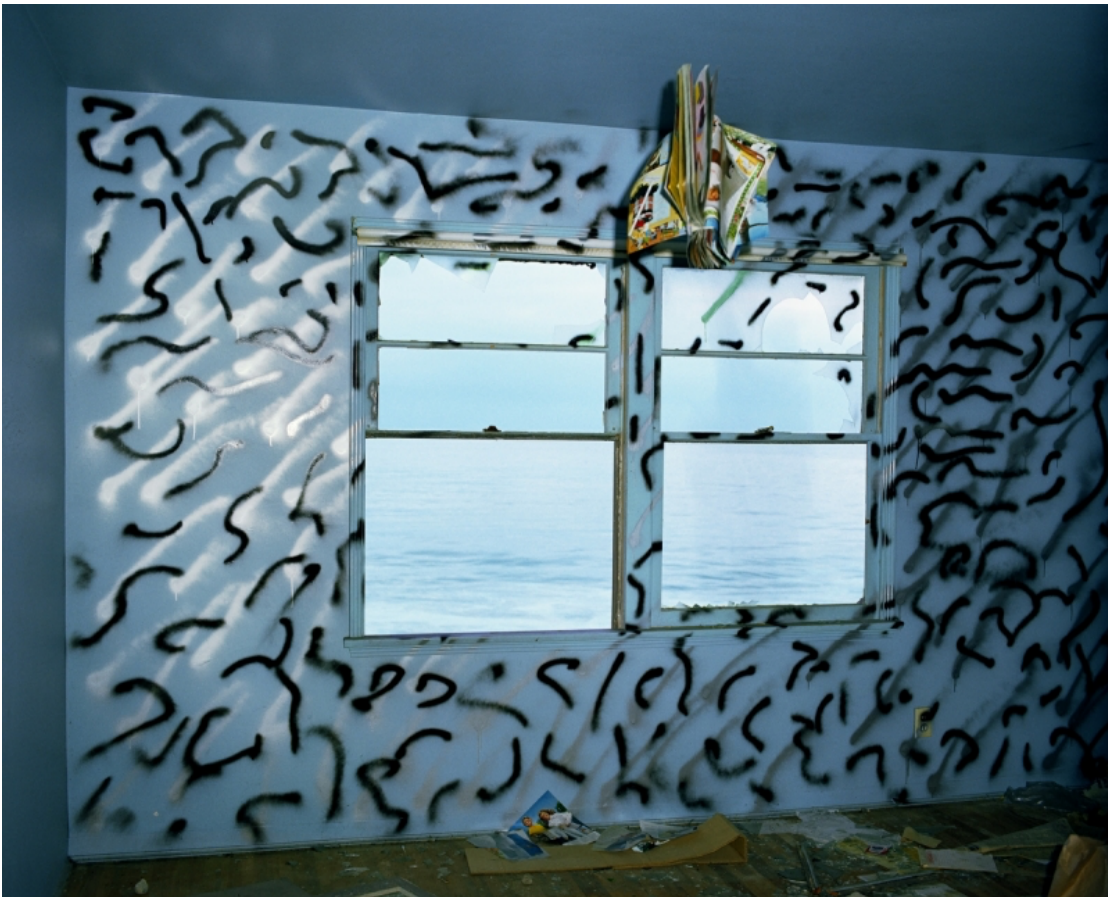
John Divola Zuma #68 , 1977/2006 Archival pigment on rag paper 61 × 76,2 cm (24 × 30 inches)