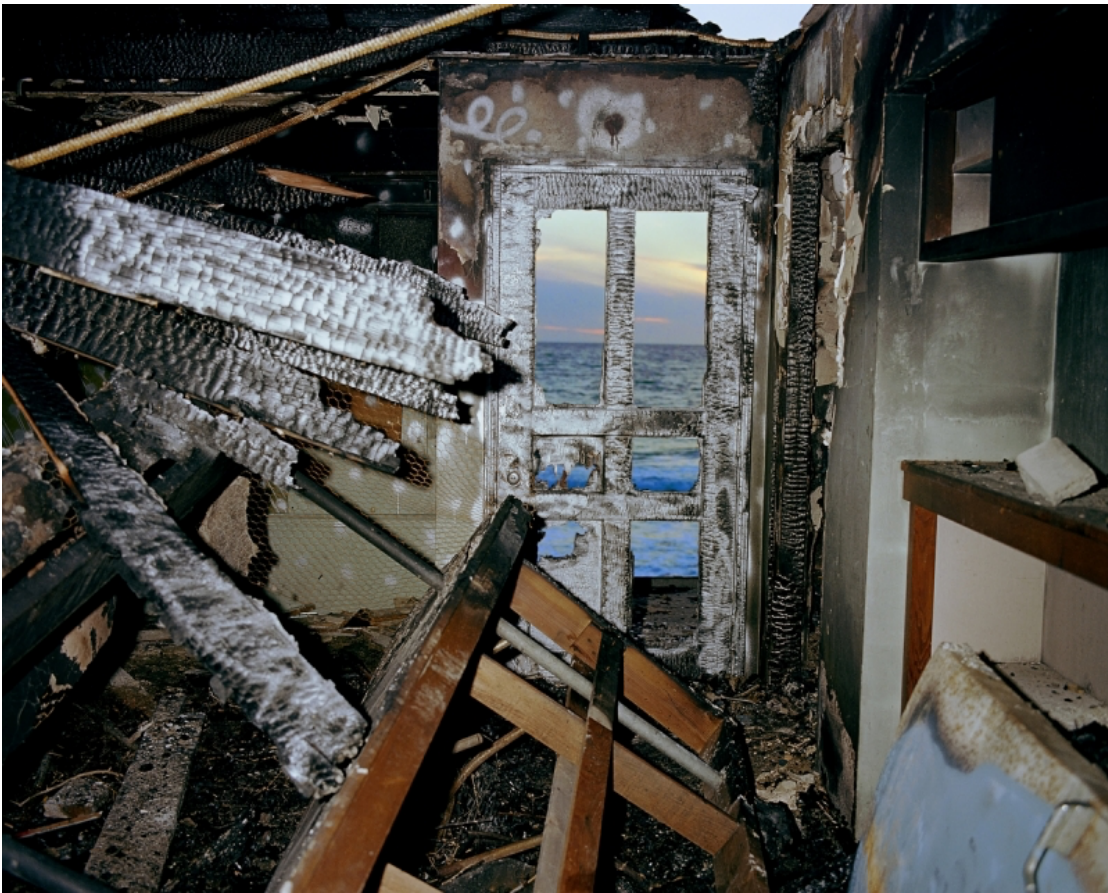
John Divola Zuma #14, 1978/2006 Archival Pigment on Rag Paper 61 × 76,2 cm (24 × 30 inches)