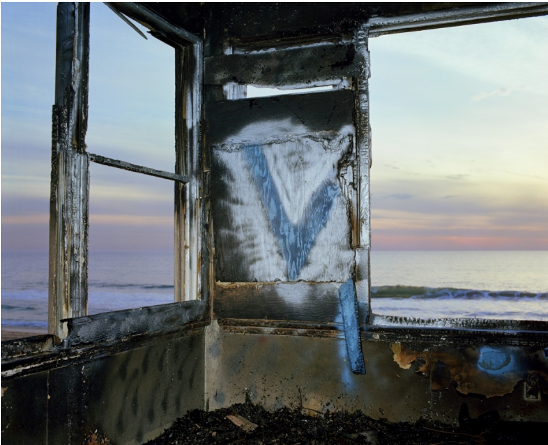
John Divola Zuma #63 , 1978/2006 Archival Pigment on Rag Paper 61 × 76,2 cm (24 × 30 inches)