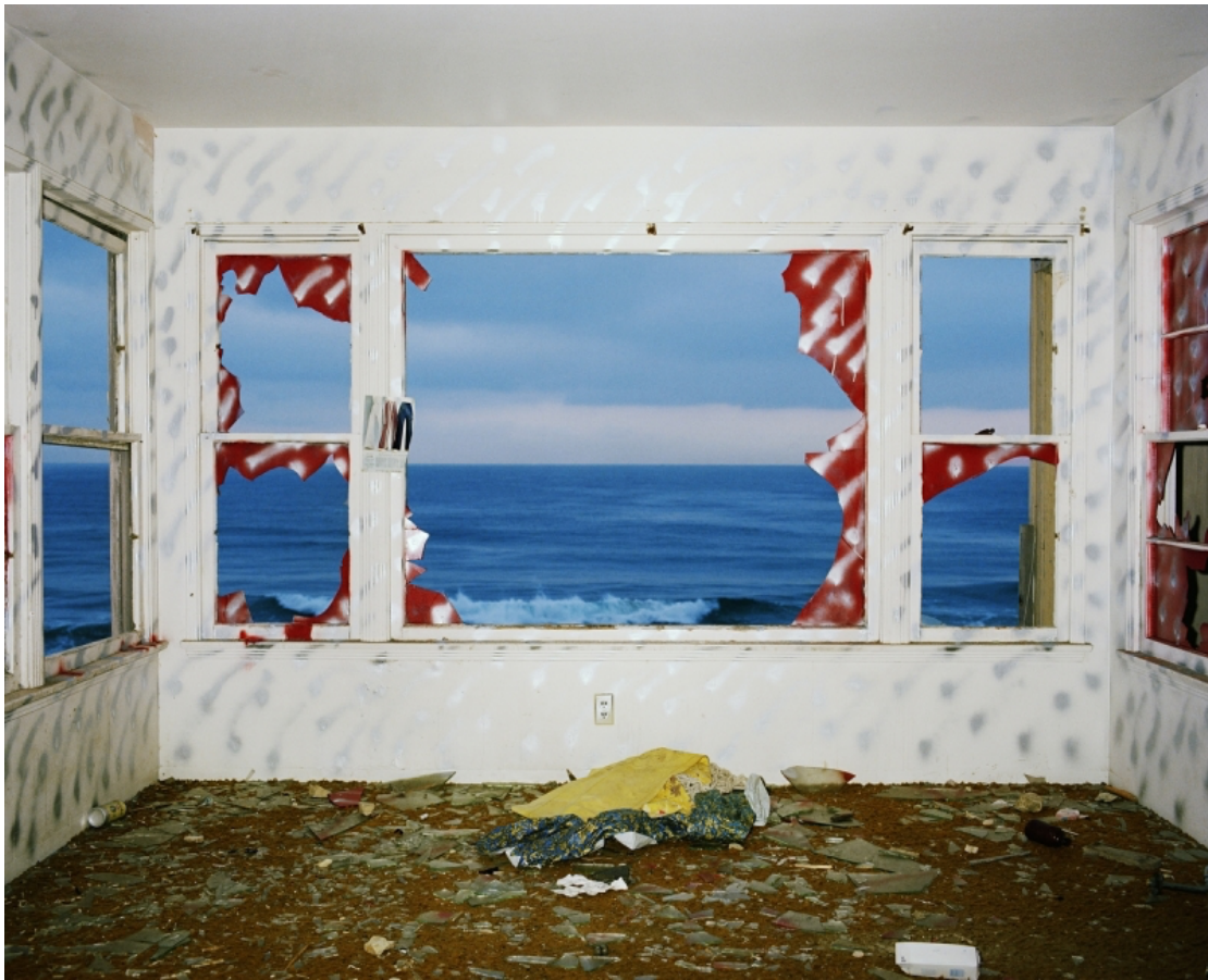
John Divola Zuma #75, 1977/2006 Archival Pigment on Rag Paper 61 × 76,2 cm (24 × 30 inches)